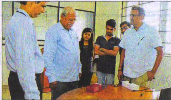
Union Minister of State for Drinking Water and Sanitation Ramesh Chandappa Jigajinagi takes a look at the model on calling bell initiative on cleanliness, at Sahyadri College of Engineering and Management.

As a response to the concept, a team of experts from the institute converted the concept into an end product